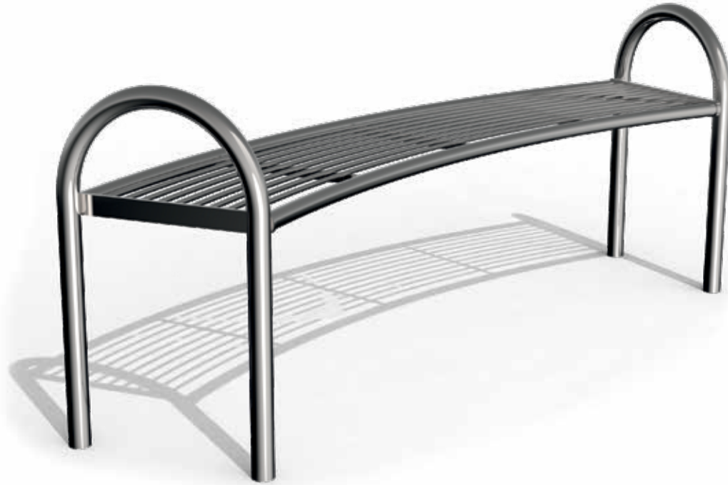
Diagram 1: Over all view