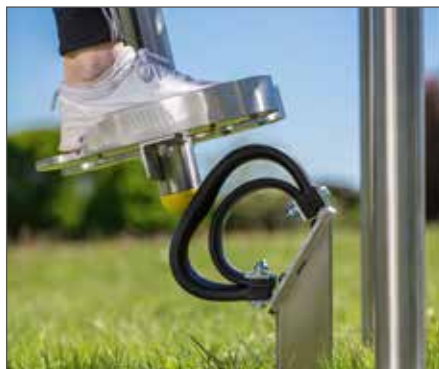
Slowing down the impact of the seesaw by the outer circle.