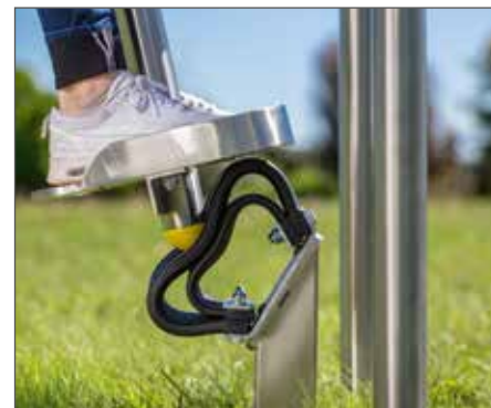
The circle inside ensures stability and a soft absorption.