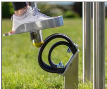
Operating mode of 2-phase shock absorbtion:

The Terrasoft seesaw softener can also be mounted directly on the seesaw frame as a shock-absorbing element.