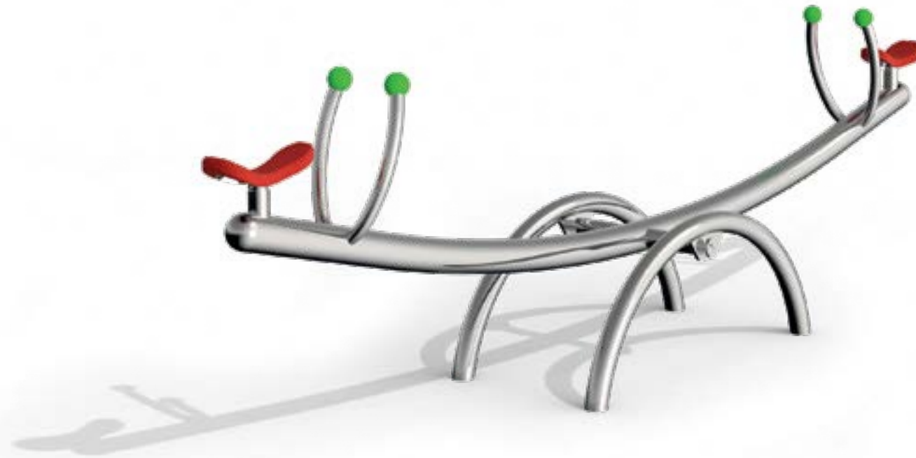
Diagram 1: Overall view of play equipment