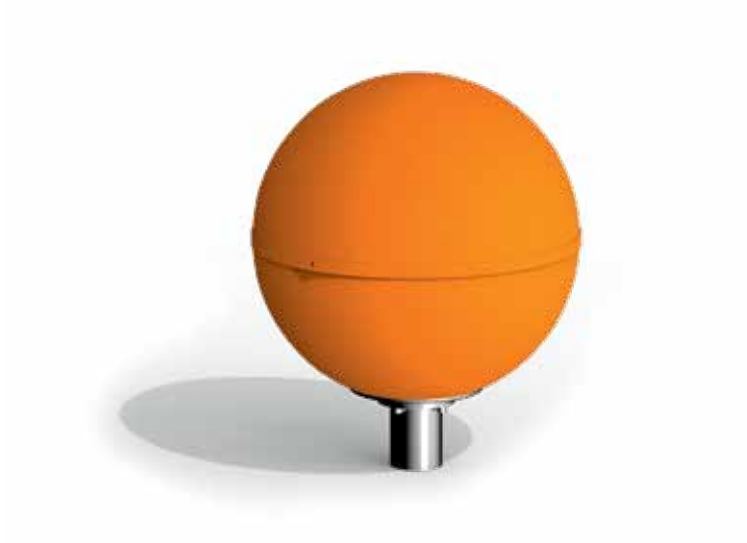
Diagram 1: Overall view of the play equipment