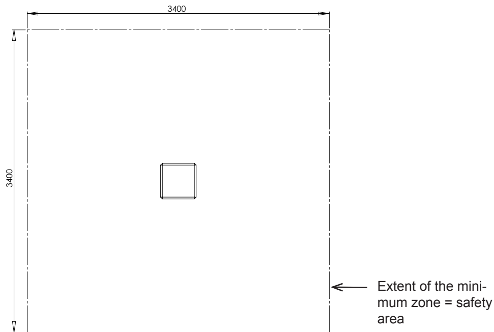
Diagram 3: Top view „quadro“

Attention: If the play equipment has been incompletely installed or partly dismantled when carrying out maintenance and repair work, this may lead to particular risks of injury for the user. For this reason, make clearly visible that the equipment shall not be used in such cases.