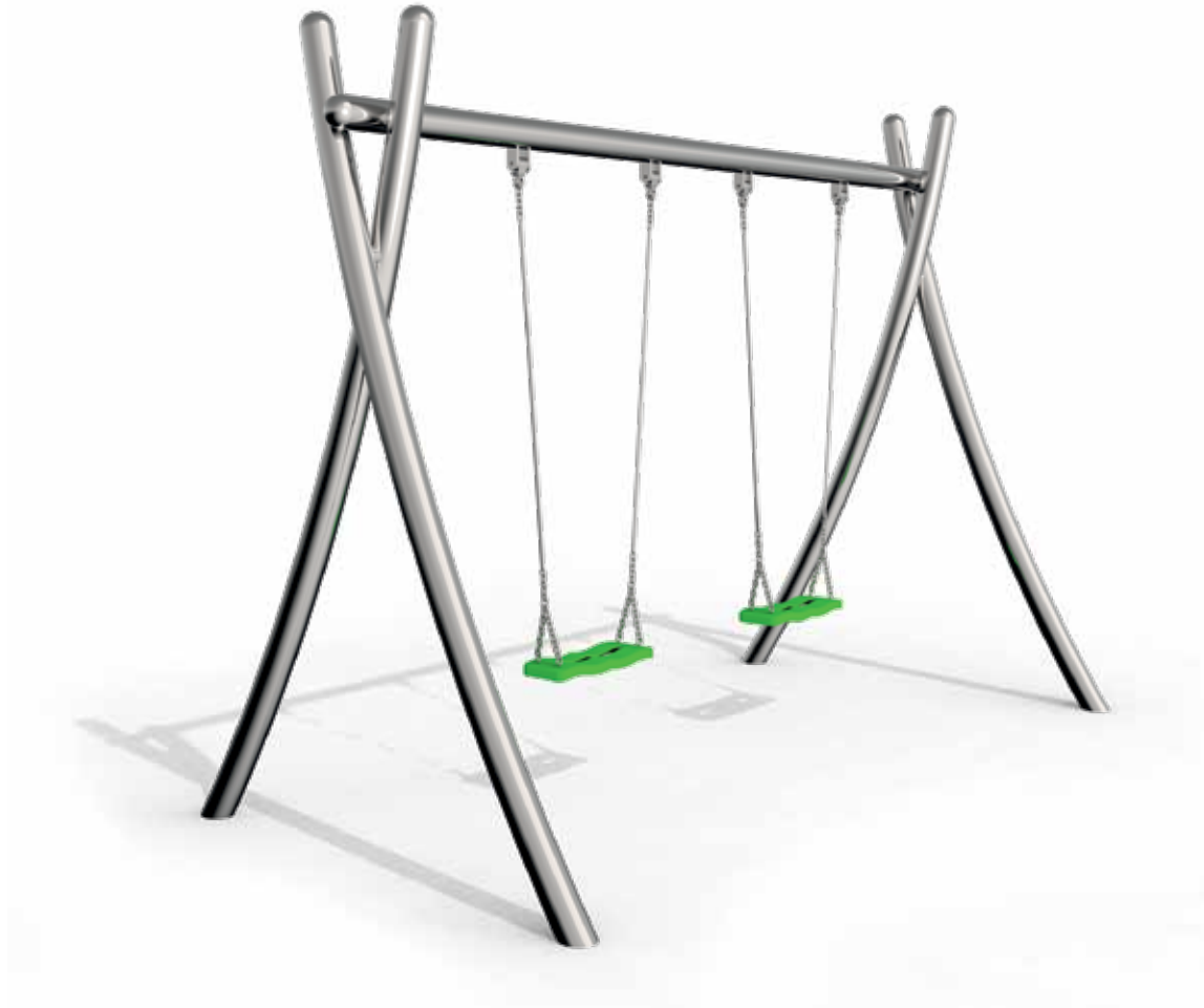
Diagram 1: Overall view of the play equipment