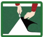
⑦ Cut the artificial grass into the shape desired