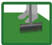
⑨ Rake or sweep up all the artificial grass remains