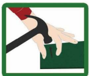
⑧ Nail the grass into place