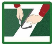
③ Cut the edges