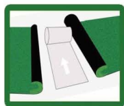
④ Roll out the seam-tape