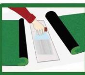
⑤ Distribute adhesive