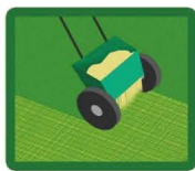
⑩ Infill silica sand (optional) and then rake or sweep