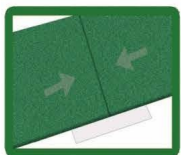
⑥ Press the artificial grass down & fix it