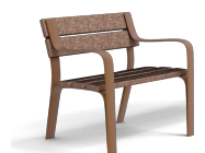
Citizen Eco UM301SPR