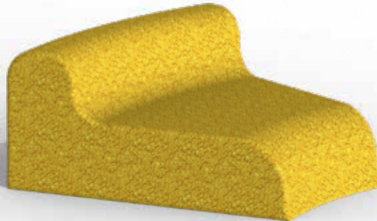
Item No. 35 2328 xx1