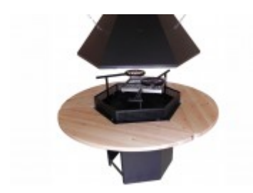
"Premium" 6-corner grill and chimney