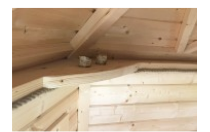
Shelf for Grill cabin