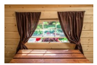
Brown curtains set