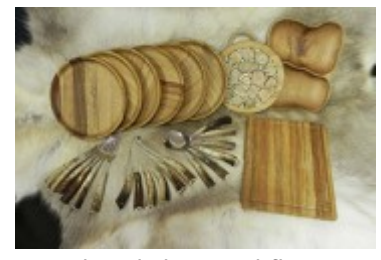
Wooden dishes and flatware set**