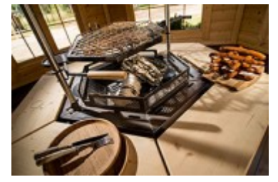
Grill table safety fence*