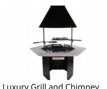
Luxury Grill and Chimney