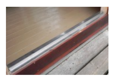
Stainless steel door sill