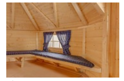
Blue curtains set