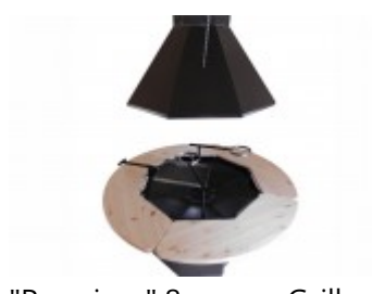
"Premium" 8-corner Grill and Chimney set