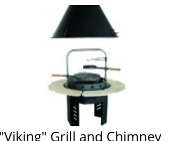
"Viking" Grill and Chimney