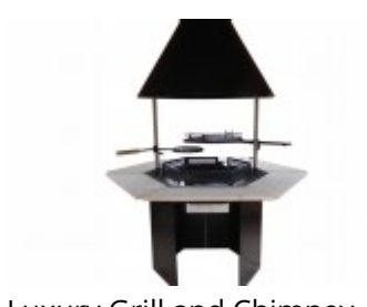
Luxury Grill and Chimney