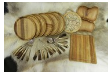
Wooden dishes and flatware set**