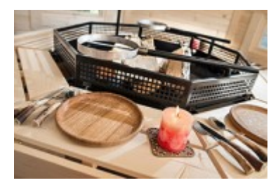
Grill table safety fence 8 corners*