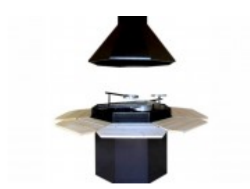
Standard 8-corner Grill and Chimney