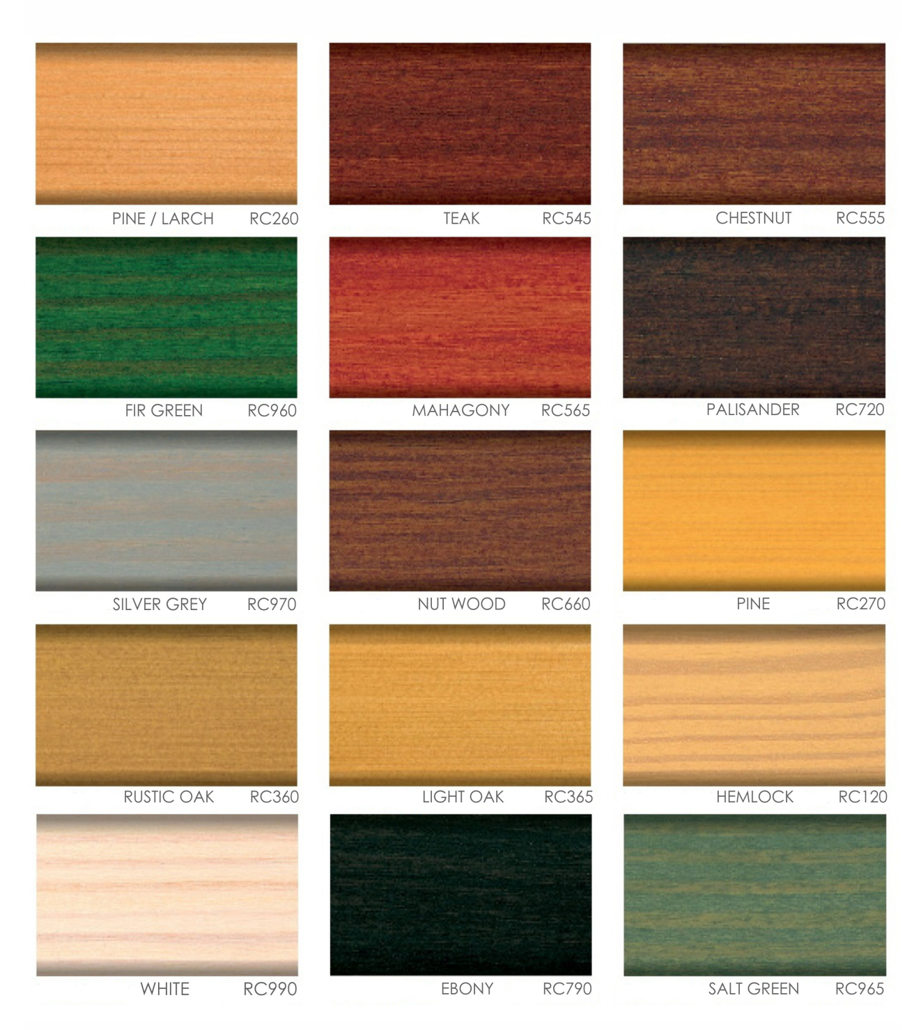
PLEASE NOTE: The colors shown in the catalogue and website may not 100% match the color you will receive. The color of the wood material affects the final color.

Water-based, quick drying premium total protection for wood outside. Thin layer varnish – 3 in 1: impregnation, primer, and varnish!